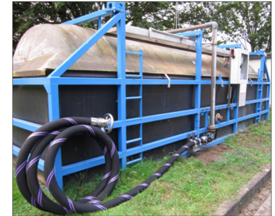
Transfer of sensitive media at any place.