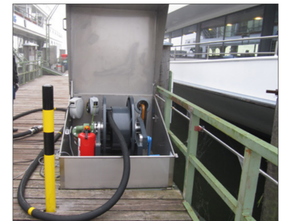
Protecting people and environment, preventing disasters.